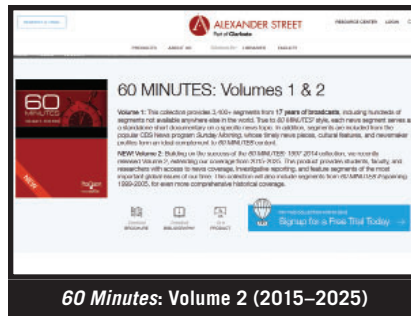
60 Minutes: Volume 2 (2015–2025)