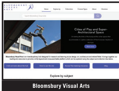
Bloomsbury Visual Arts

More than 80 new and forthcoming databases and online products