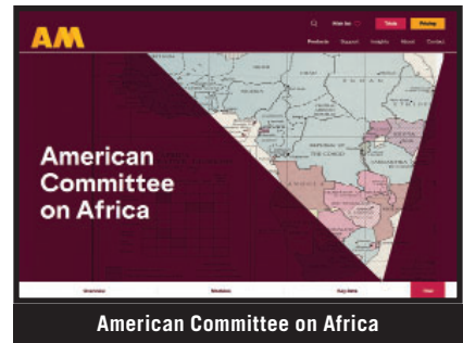
American Committee on Africa